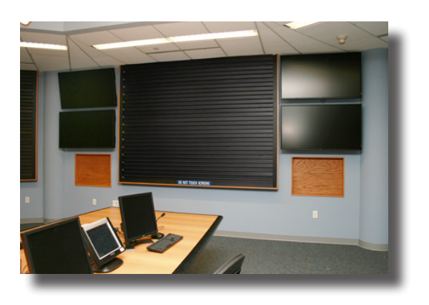
New flat screen televisions in the SEOC.

The Chief of Operations and lowa Department of Transportation computers will now be able to provide images to be displayed on the big screen via the new controller.