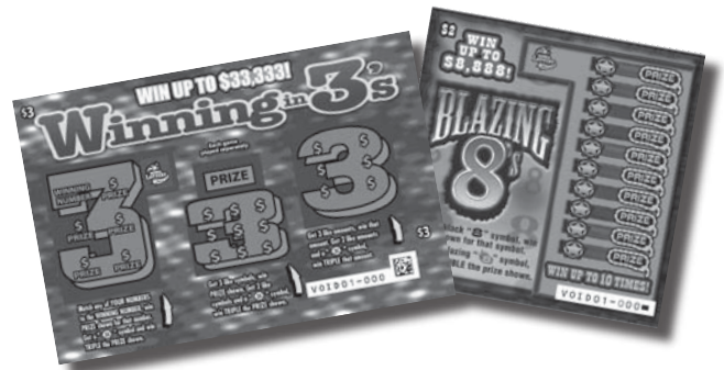
The last top prizes were claimed in the "Winning in 3's" and "Blazing 8's" scratch games in February and the lottery ended both games.

Some retailers may not be familiar with what goes on behind the scenes at the lottery as