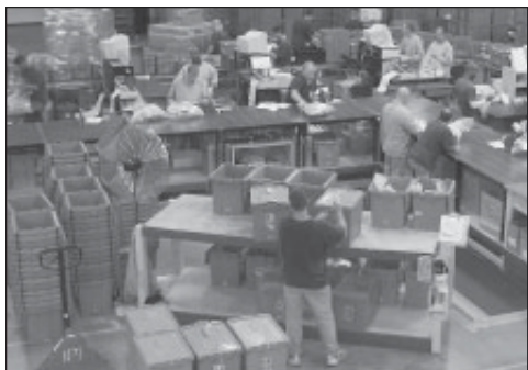
A new commissary catalog was recently released providing Iowa's