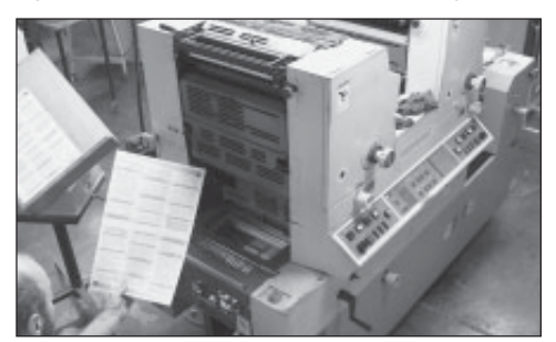
New Graphic Arts equipment includes a Hamada 2-color press (above) and a platemaker (below).