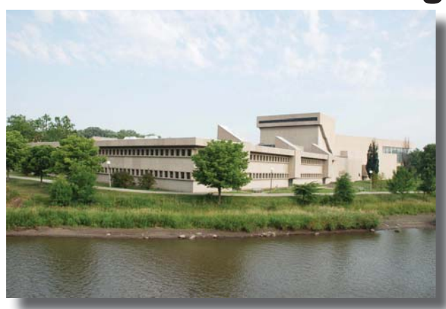
Hancher/Voxman/Clapp Complex, University of Iowa.

East, which were heavily damaged by flooding in 2008. Hancher/Voxman/Clapp received an additional