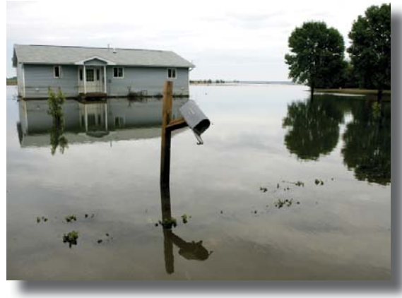
Oakville home surrounded by flood waters in 2008.

State officials advise people to begin assessing their flood risk by be-