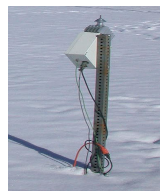
Figure 2. The Rosemount Aerospace Corporation Model 872C2 icing detector mounted on a temporary structure

Rosemount sensor was attached to a vertical pole (Figure 2) with data and power connections extending to the RWFRF's data collection facility 20 meters to the south.