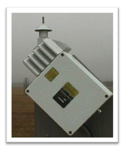
Figure 1. Rosemount 872C2 icing detector

The sensor uses a one-inch rod that is driven mechanically at a vibration frequency of 40 kHz. As ice accumulates on the rod, the added mass reduces the mechanical vibration. Circuitry in the system records the frequency changes and provides an interface to external data logging devices. Once the frequency reduces to a pre-set minimum due to ice accretion, a heating cycle is triggered to shed the ice from the vibrating rod. This permits a continuation of the ice accretion measurements.