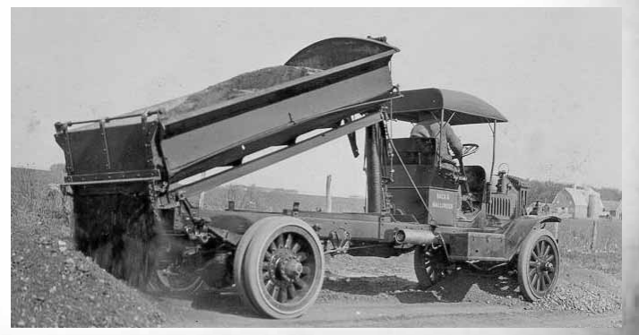
Early 1920s dump truck

Beth Collins at 515-239-1702 or beth.collins@dot.iowa.gov.