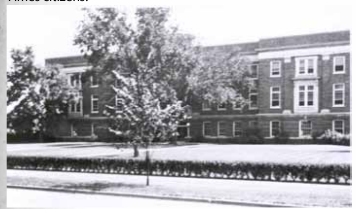
Iowa Highway Commission Building in Ames completed in 1924

Officials stated today that two transformers had been installed in lieu of the one that failed last night, so that future events at the commission building would not be threatened with the "embarrassment" experienced last night.