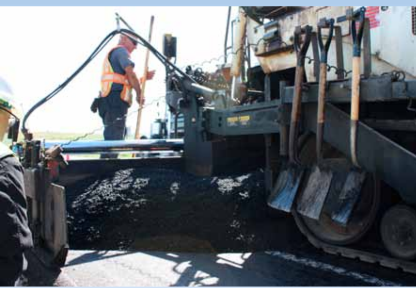
A Norris Asphalt employee works on the warm-mix pavement on U.S. 34 near Creston.

On Sept. 7, more than 30 attendees witnessed the benefits of WMA first hand. The asphalt was produced at approximately 260 degrees Fahrenheit, a drop of roughly 50 degrees below hot-mix asphalt production temperatures and compacted behind the paver at 245 degrees Fahrenheit.