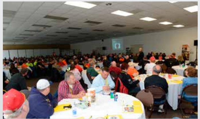
More than 500 motorcycle enthusiasts gathered for the one-day conference.