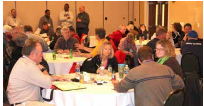
Sharing ideas with other teachers was an important part of the conference.

Recent changes to Iowa's graduated driver's license laws are geared to increase the instruction time teens have behind the wheel. Currently, under the graduated driver licensing program, drivers under 18 must hold an instruction