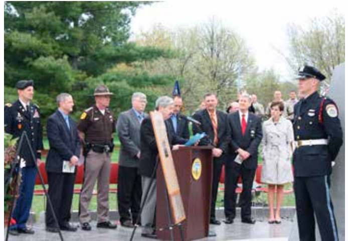
Governor Terry Branstad reads a proclamation at the ceremony.

At the memorial ceremony, family members were presented a purple heart and a plaque honoring each fallen peace officer near a pole with the U.S. flag and a new Iowa peace officer memorial flag flying at half-staff to mark the occasion. A 21-gun salute was fired into the gray sky in tribute to the fallen men.