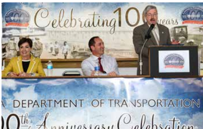
Gov. Terry Branstad spoke about Iowa's unique transportation system.