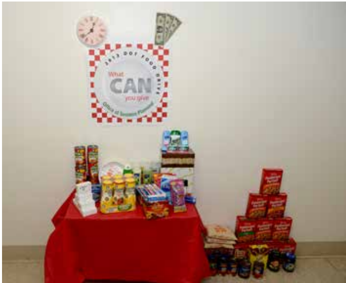
This structure was built by employees in the Office of Systems Planning.