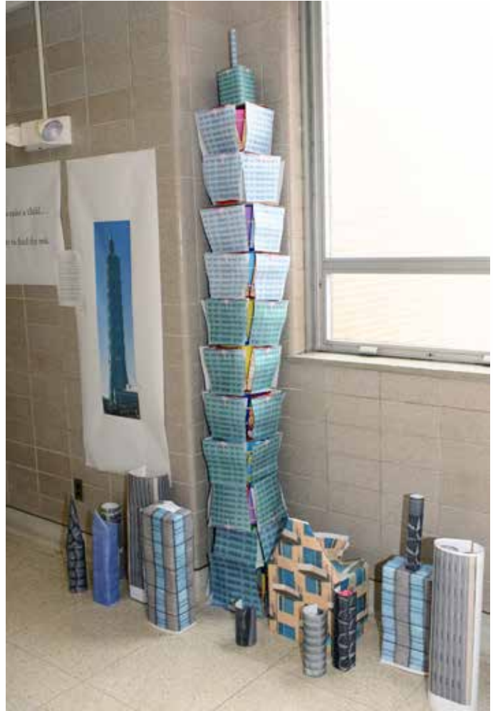
The Office of Design structure theme was "It takes a village to raise a child and a city to feed the rest."