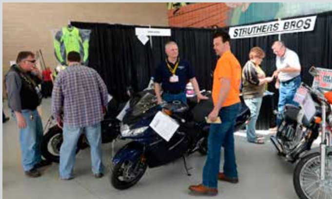
More than 40 vendors set up at the MSF to talk to attendees.