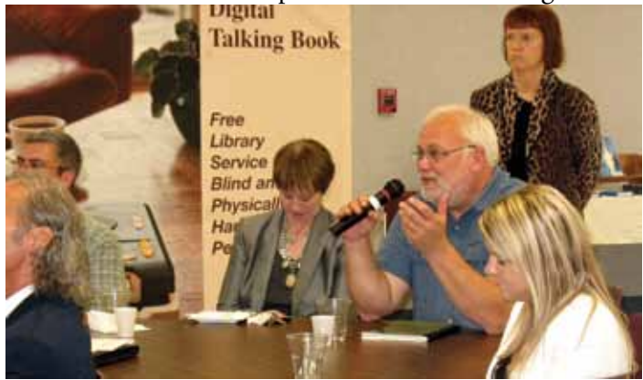
Audience members asked many good questions during Q&A sessions after each panel.