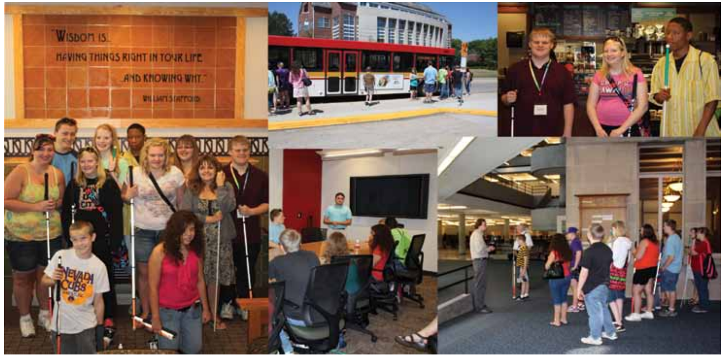
Ready-Set-Go participants packed many experiences into just a few days as they explored the world of college life.