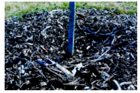
Donut around trunk — RIGHT!

your tree develops cankers, the situation cannot be reversed, and your tree will die within a few seasons.