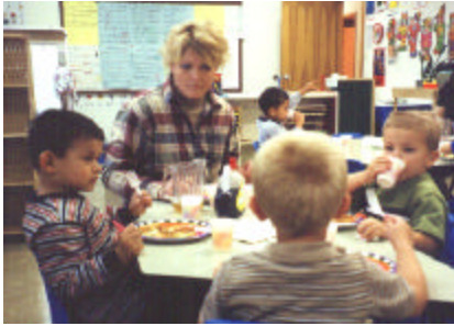
Precious People Preschool: addition of breakfast for Head Start requirements