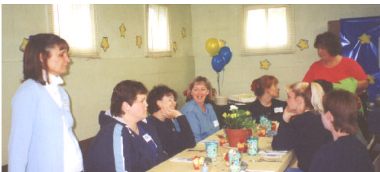
Child Care Provider Appreciation Party: pictured are licensed center staff, preschool staff, home providers, and empowerment board members.

With the addition of Child Care Health Consultant and Child Care Educator, all of the known child care providers, registered and non-registered, have been receiving information to help increase the quality of their service. To celebrate this success, along with 5 providers completing their Child Development Associate class hours, we held a child care provider appreciation party. Over $250 was donated by local businesses for door prizes.