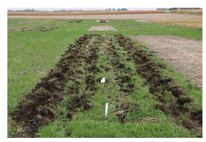
Figure 1a. Rye/oat cover crop in fall 2005 after liquid swine manure injection

We have demonstrated that a rye/oat cover crop reduces soil inorganic N after liquid swine manure injection. Cover crop impacts on soil N are observed within a month after application and persist into the following spring. Cover crop nutrient uptake was higher than the control in the spring when at least 200 lb manure N/ac was applied. These results quantify the potential for cover crops to enhance plant nutrient uptake and reduce N leaching potential in farming systems using manure. Our future research will investigate when cover crop nutrients are released and become available to subsequent crops.