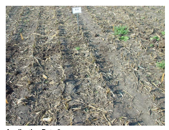
Application Rate 2