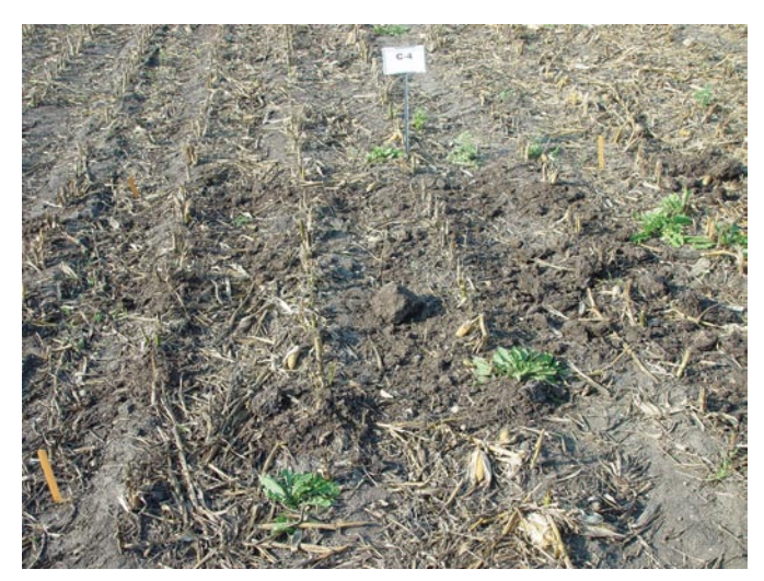
Application Rate 4