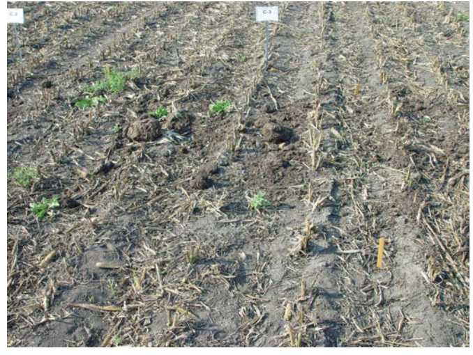
Application Rate 3