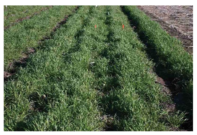
Figure 1b. Rye/oat cover crop in spring 2006