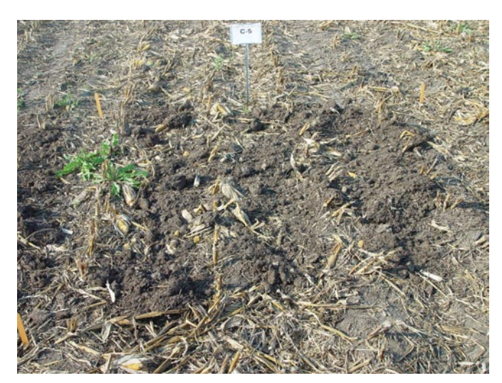
Application Rate 5