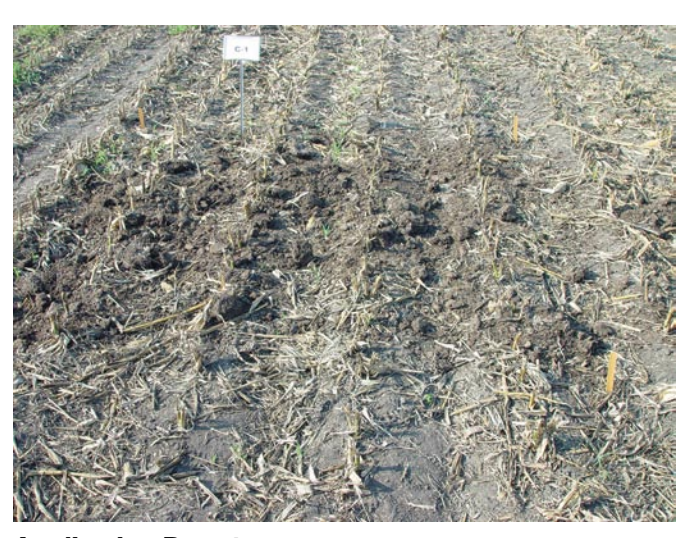
Application Rate 1

For more information on solid manure calibration and uniformity of distribution please see Iowa State University Extension Publication PM 1941 Calibration and Uniformity of Solid Manure Spreaders . This publication can be ordered through any ISU Extension county office or online at https://www.extension.iastate.edu/store/.