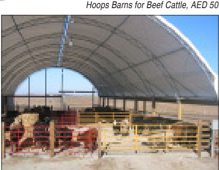
The prototype has three pens for cattle and a feed bunk that can be filled from outside.

The feed bunk that runs along the east wall can be filled from the outside. Under the hoop next to the bunk is a 20ft. concrete floor that is used when manure is scraped. The rest of the floor is covered with limestone screenings on top of a geotextile fabric.