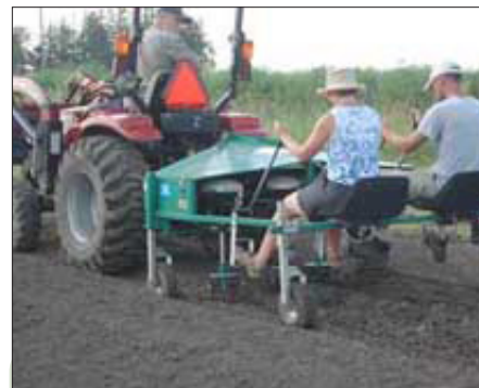
Above: Participants at an August 22 workshop test out weeding equipment. Also see page 8 for another photo.

The Leopold Center is hosting this event for its university, nonprofit and educational partners.