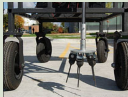
Right: This is a close-up of the rotating tines that also will move back-and-forth as the machine travels down the row. They plan to field-test the prototype yet this year in grass plots.

be used most effectively in the field and provide operational guidelines for users. The researchers want to devise systems to help the machine deal with those vegetable crops (e.g., cabbage, kale and broccoli) that have more distinguishable features than weeds.