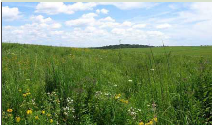
Top: Bee on purple prairie clover ( Dalea purpurea ).