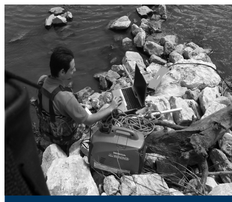
Monitoring of bridge infrastructure.

A remote but cost-effective means of monitoring scour is highly desired by DOTs across the country, because it will provide real-time condition assessment that can be used in decision making for downtime, repair costs, and estimating the remaining useful life of critically scoured bridge structures—translating to an inexpensive, automated bridge monitoring system with potential applications for other critical infrastructure, such as dams, levees, or other near-shore structures.