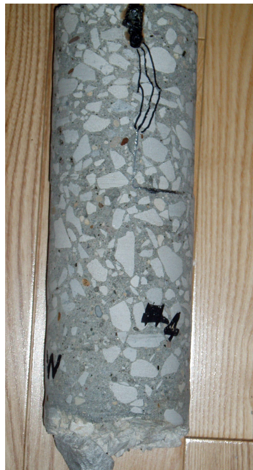
Core sample showing a crack extending from the joint former