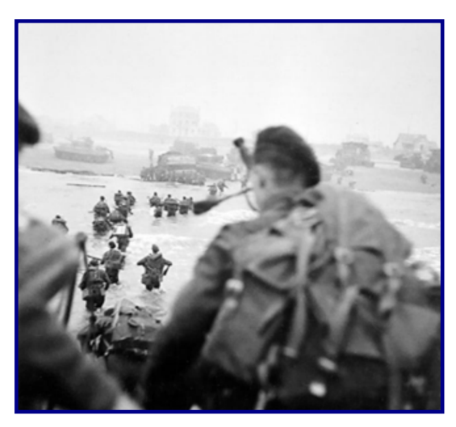
Landing on Sword Beach. Piper Bill Millin is in the foreground; Lord Lovat, on the right of the column, wades through the water

And, of course, what would an article be without a Youtube video: <a href="http://www.youtube.com/watch?v=B4WZwz2C72M&feature=related">http://www.youtube.com/watch?v=B4WZwz2C72M&feature=related</a>