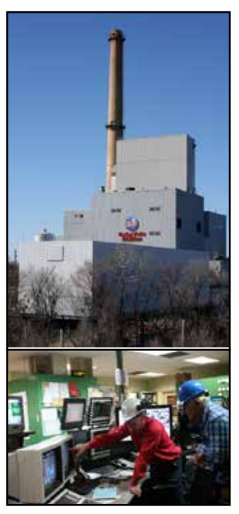
Cedar Falls Utility employees monitor a test burn of pelletized prairie biomass from the Prairie Power Project site.

The Tallgrass Prairie Center is currently in the final phase of its sevenyear study entitled the "Prairie Power Project" which has the following goals: 1) to determine the maximum production of biomass by mixtures of prairie species and the effect on wildlife habitat, 2) to determine effects of frequency of harvesting on biomass production and patterns of harvesting on wildlife, 3) to determine energy production and stack by-products from combustion of prairie biomass in Cedar Falls Utilities' power plant, and 4) to measure the amount of carbon sequestered by different mixes of prairie species over five years. The Tallgrass Prairie Center hired Eric Giddens (see bio elsewhere in this newsletter) in December of 2014 to work on the third goal of the project. The following is a brief sum-