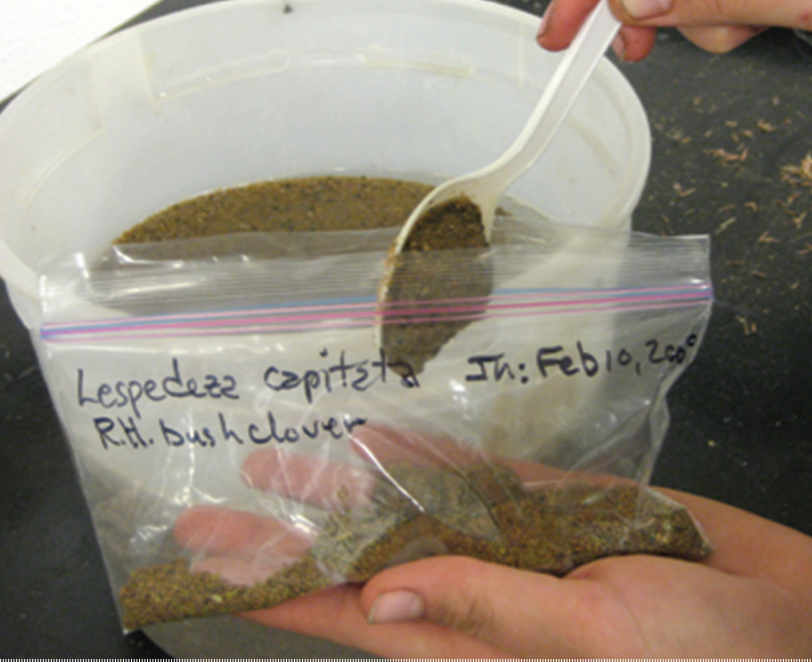
Adding wet sand to an equal amount of seed in preparation for stratification.

Most prairie species require a winter treatment, i.e. cold, moist conditions known as stratification to break dormancy. Mix seed with an equal amount of moist sterile sand, sawdust, or vermiculite and place in a Ziploc bag. Avoid excessive moisture; water should not be pooled anywhere in the bag. Use vermiculite if working with species adapted to drier conditions to minimize the risk of rot. Place seeds in refrigerator (32 to 45 °F or 0 to 10 °C) for the recommended period of time (see Table on back). Check bags weekly for mildew or dryness. A few species, among them American vetch ( Vicia americana ) and butterfly milkweed ( Aesclepias tuberosa ), will germinate at these temperatures, so plant immediately if this occurs.