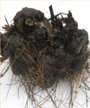
Rough blazing star corms dug in fall for transplant. Large corms can be cut in half.

A corm is a short, fleshy, vertical underground stem. The blazingstars ( Liatris spp. ) grow from corms. In the fall these can be dug up and divided in a way similar to potatoes, and transplanted for mature flowering plants the next growing season. Small corms (cormels) can be broken off the main corm, or cut larger corms (2 inch diameter or more) in half.