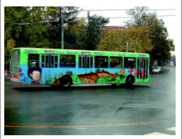
A fully decorated city bus in Parma, Italy

Outside of Rome, we had the opportunity to use large touring motor coaches, hydrofoils and ferries, a funicular rail line on Capri, Eurostar intercity trains, the Milan subway system, and, of course, many taxis. The best part of public transit in Italy is it's readily available and inexpensive. The worst part is they are usually crowded and offer abundant opportunities to pickpockets and thieves.