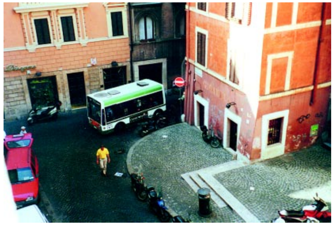
An electric minibus navigates a tight Roman street

The metro has only two lines that form an "X" and meet at the train station. This system was built in the 1930s and hasn't been significantly enlarged since the completion of the system in the 1950s.