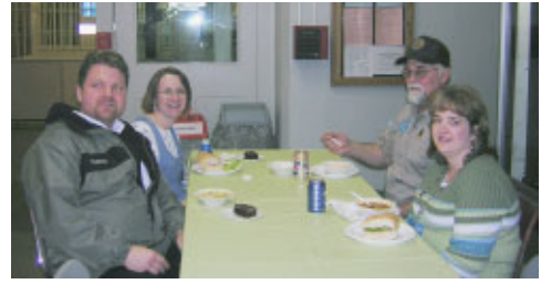
Soup and Sandwich Lunch