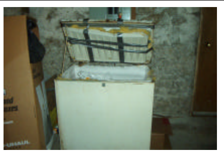
Holding on by a thread...um...duct tape.