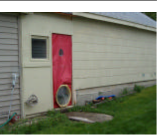
Blower door installed.