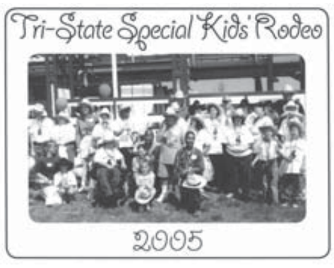
"Thank you for the use of the ramps for the 5th Annual Tri-State Special Kids' Rodeo. We had 102 participants this year and the ramps make it easier to get them on the horses."

IPI Fort Madison received the thank you shown below from the Tri-State Special Kids Rodeo Committee for the use of Mitchellville's ramps. The ramps are used to help get the kids on the horses from their wheelchairs.