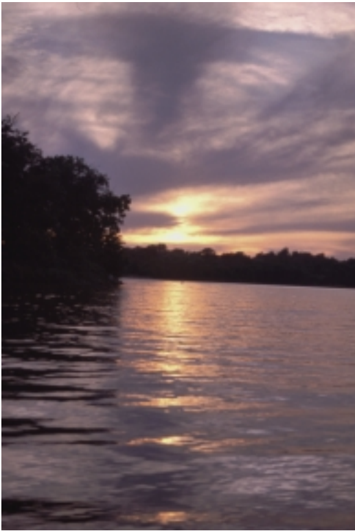
Lake Icaria, Adams County

underlying geology, but are also influenced by biological processes in the lake. Median pH was 7.9 and alkalinity was 151.0 mg/L.