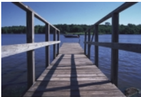
Viking Lake, Montgomery County (both photos)

Bachmann and Iowa State University completed a 1980 study of 115 significant publicly owned lakes. States were required by the U.S. Environmental Protection Agency to conduct a survey of their public lakes in need of restoration and/or protection and to develop a priority ranking of the lakes for restoration projects. Significant publicly owned lakes are those lakes which are principally maintained for public use, contain a minimum surface area of 10 acres, and are capable of supporting fish stock of at least 200 pounds per acre. Information from this 1980 study has served as a basis for selecting lakes for restoration in Iowa.