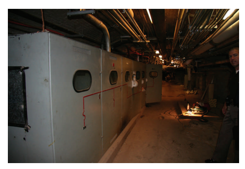
Electrical switchgear equipment in the sub-basement of the Capitol

Dental Insurance Open Enrollment. You have an opportunity to enroll yourself and eligible family members in dental coverage during this enrollment and change period.