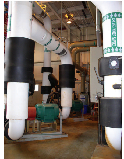
Inside the Central Utilities & Energy Plant

The Utilities & Energy Plant also has two new pumps for the chillers, which use cold water to cool the air that is pumped through the air conditioning system. The new pumps allow operators to throttle the motors back and control how the water