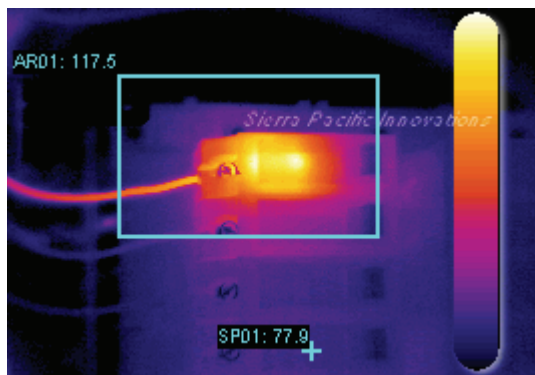
A photo of the same breaker panel, using the new infrared camera