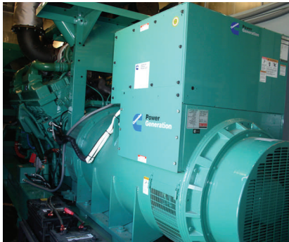
One of the Complex's new generators

Humming along on the south side of the Capitol Complex is a building few state employees probably give much thought — the Central Utilities & Energy Plant. All employees on the Complex, however, are significantly affected by the operations that go on there — heating and cooling of the buildings, fire alarm monitoring, and energy generation. Recent improvements to this facility will increase efficiency and save money, all while making the plant's operations even less noticeable to its customers.