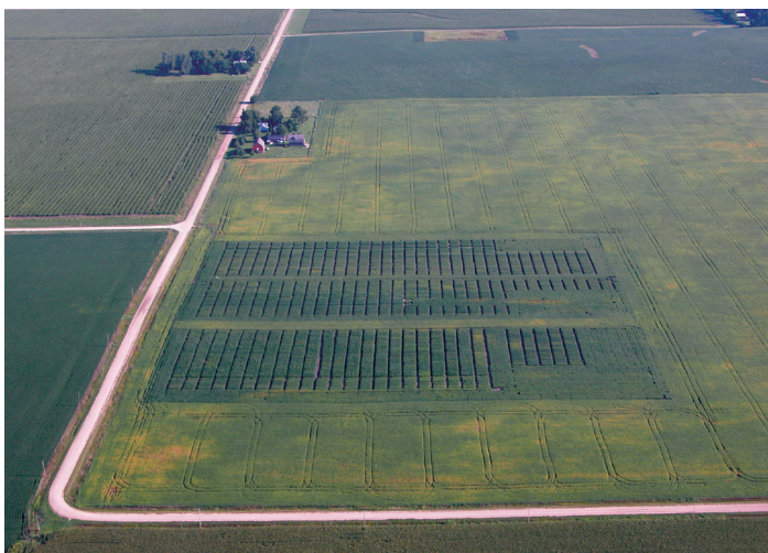
Figure 2. Checkoff funded research near Nevada, Iowa. Investigating agronomic practices using new technologies.

strategies. Bean leaf beetles and soybean aphids are insects that should be monitored frequently. Scouting can also be used to plan for next year's crop since it is often much easier to see what the yield limiting factors are in the field during the growing season than just looking at the yield monitor.