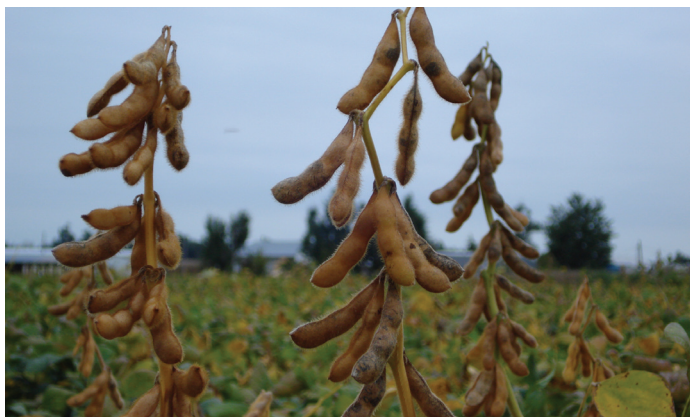
Figure 3. Quick canopy closure and rapid crop growth rate starting at flowering is important to keep photosynthesis going at a high rate to maximize pod and seed set.

Matching soybean varieties to a specific field is the foundation of maximizing soybean yields. Unfortunately, a soybean variety's genetic yield potential is only achieved when environmental conditions are perfect and such conditions rarely exist. Agronomic decisions, however, have much greater impact on yield than most people think. The soybean crop has to be raised as a "biomass" generator without any stress and optimum light interception early in the growing season since lack of biomass and vegetative nodes prior to flowering hold down the yield potential. Understanding how a soybean plant develops through the season will provide insight into selection of management practices that should lead to maintaining the yield potential. Simply putting more inputs into a management system will not improve yield if the crop does not get the right start.