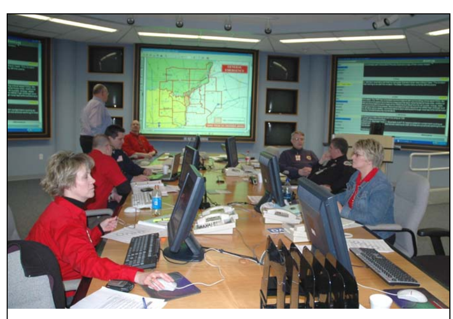
HSEMD Operations staff and members of special tactical teams coordinate information in the state emergency operations center during the threat-based Quad Cities Power Plant exercise.

The drill tested the cooperation and communication between local emergency response teams in the event of a terrorist incident at the Exelon Quad-Cities Generating Station. It was deemed a successful learning experience by Exelon officials. While pilot drills of the threat-based scenario were conducted in 2006, this was the first time the scenario was used at a