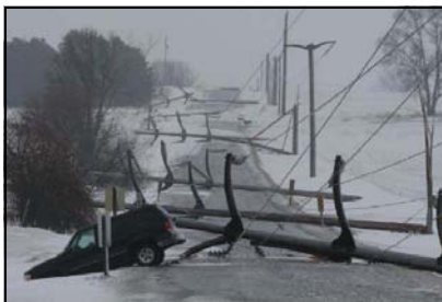
from last winter's storms.

Iowa Homeland Security and Emergency Management and the National Weather Service have declared November 8 Winter Weather Awareness Day in Iowa.